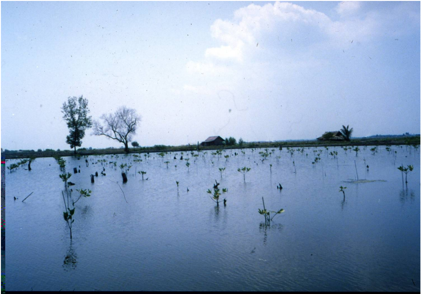
Afforestation of cleared mangrove.