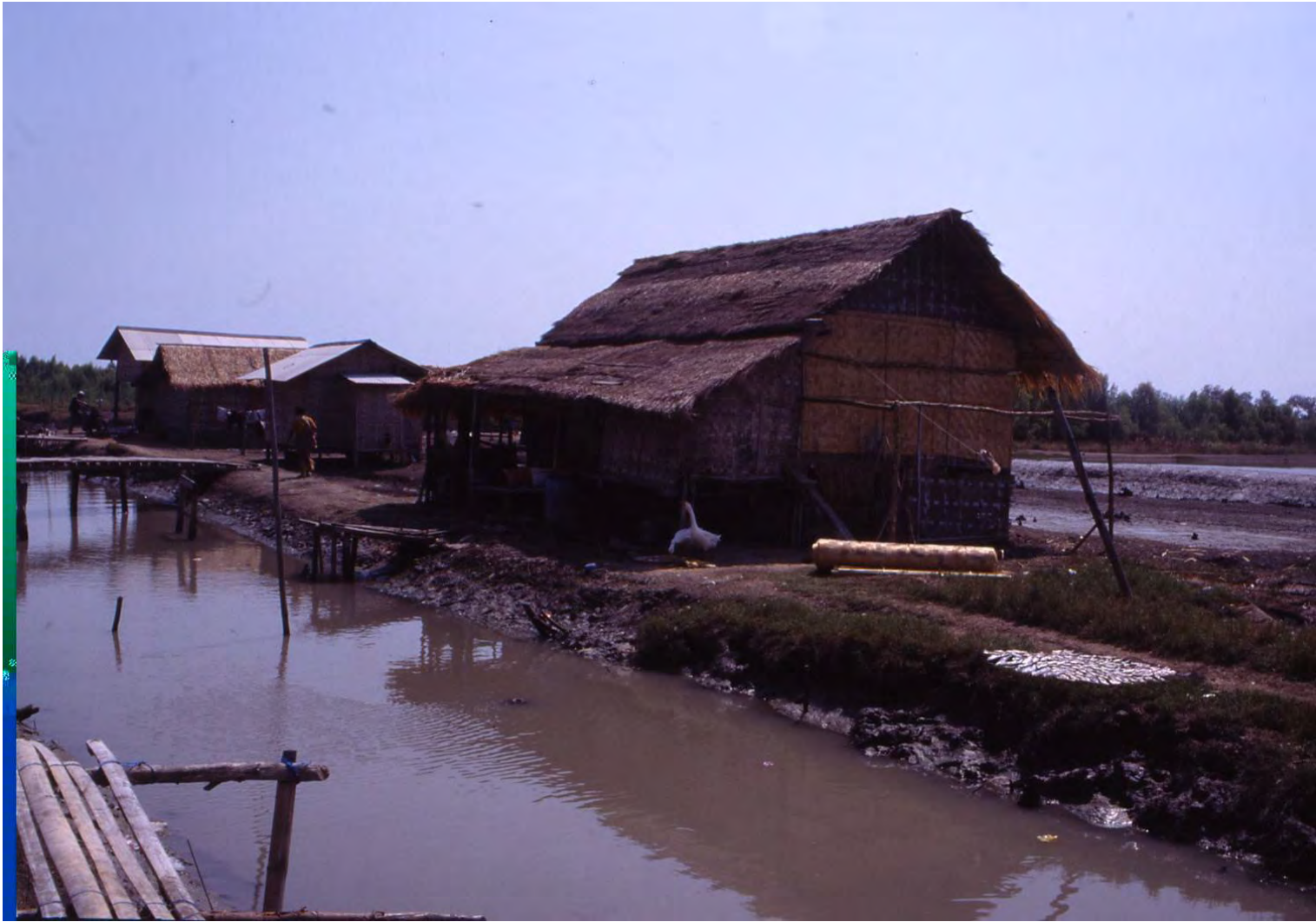
Shrimp raising pond in Sumatra, Indonesia.