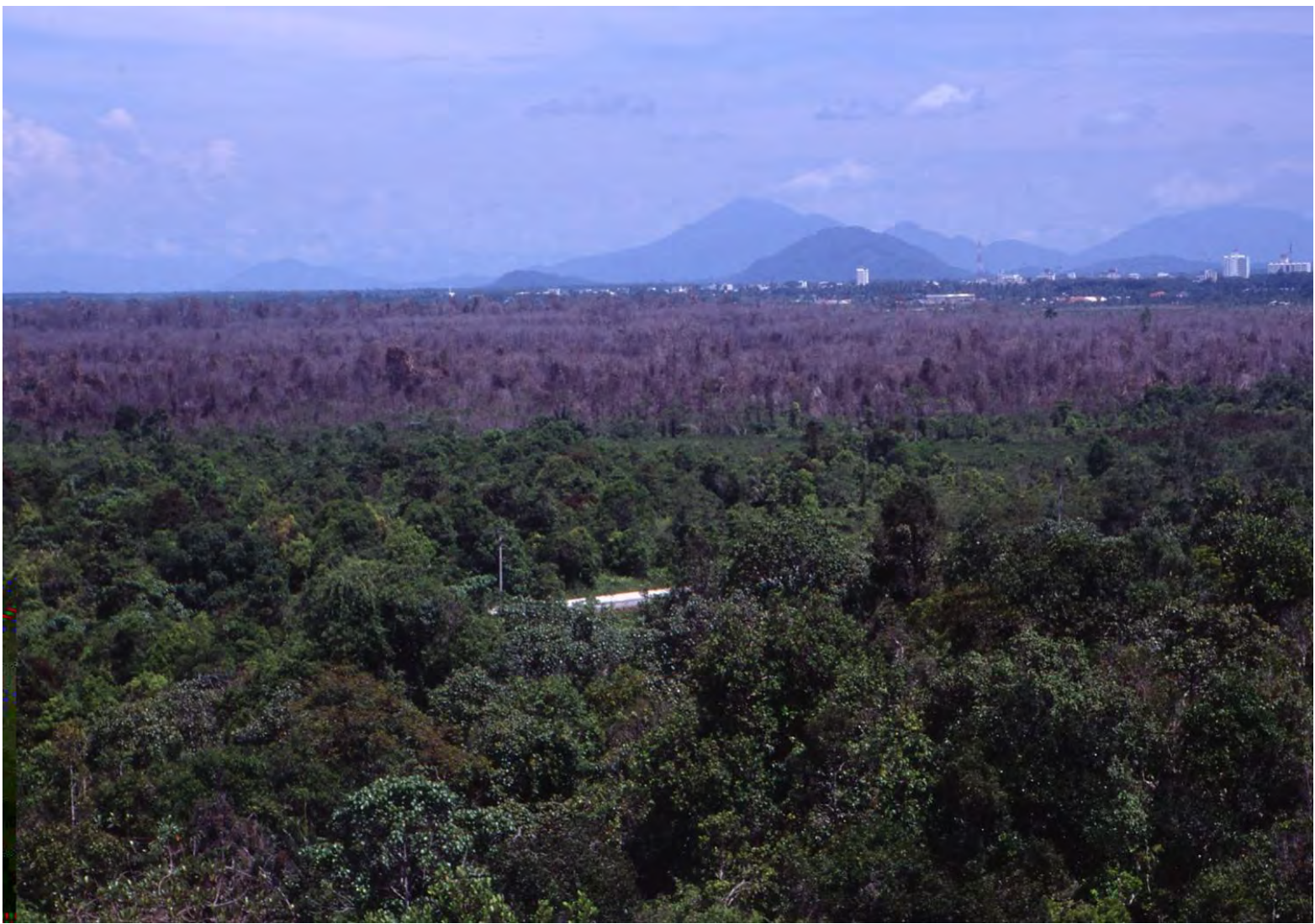
Burned wetland forest in Naratiwa, Thailand.