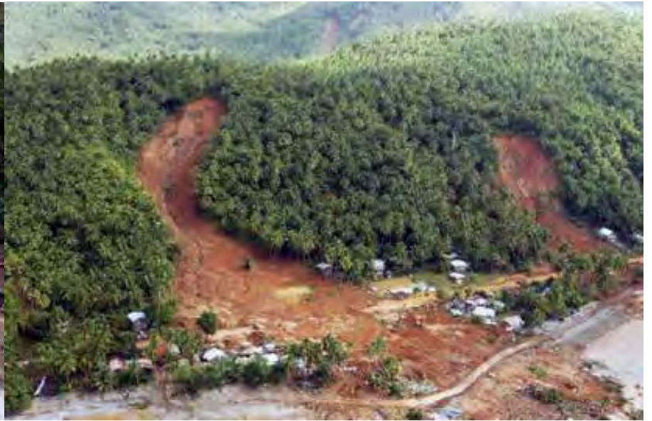
Landslide in southern Leyte, Philippines 2003. 12. 20