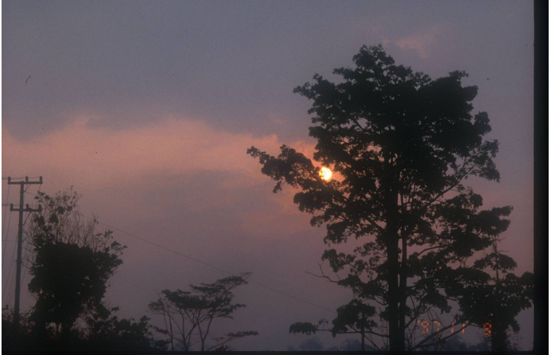
Forest fire in Sumatra island in 1997. The sun looked like the moon in the daytime.