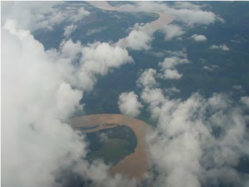
Red turbid river