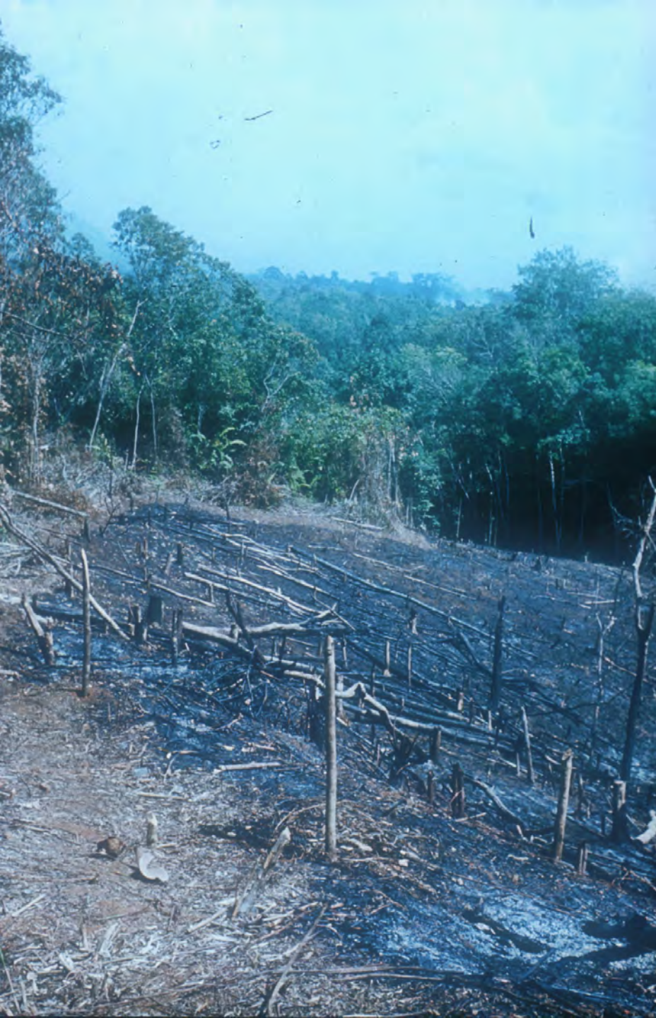
No. 65, Shifting cultivation in W-Sarawak, Malaysia