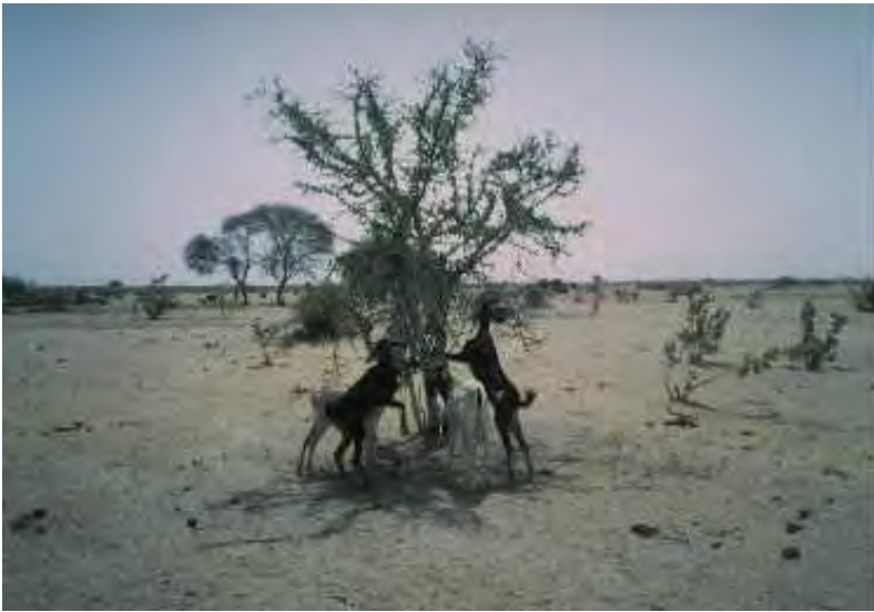
Feeding trees by over-grazing.