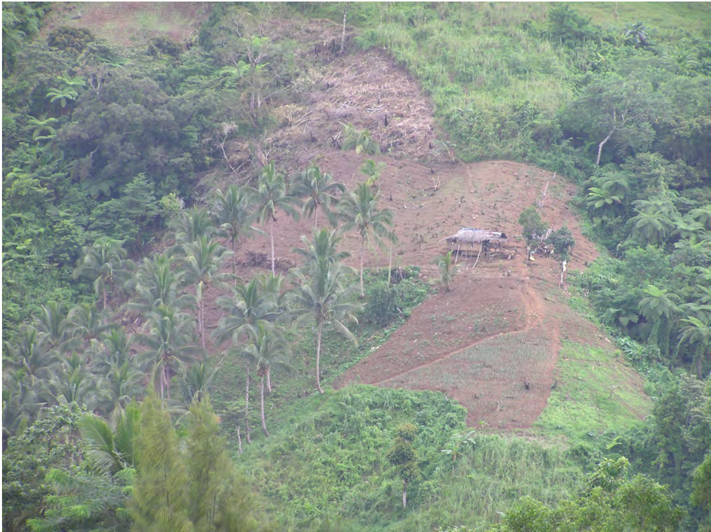
Slash and burn field in Leyte, Philippines