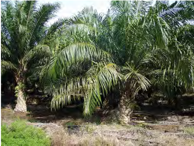
Orderly lined palm trees