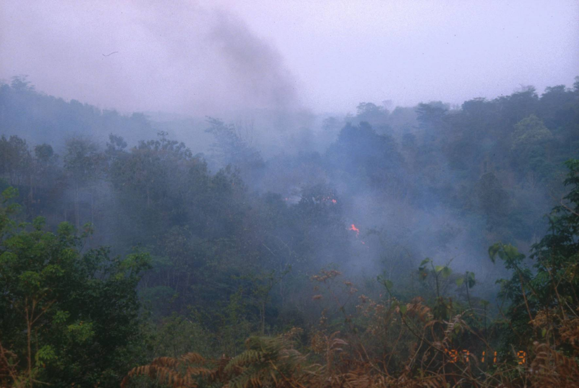
Forest fire in Sumatra island in 1997.