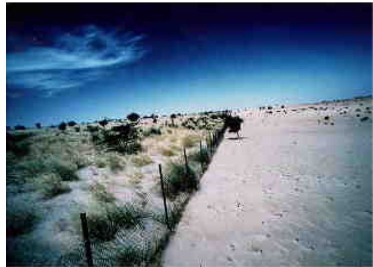
Conservation and rehabilitation of the land by enclosing the land.