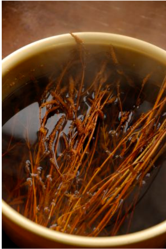
Food culture by Ainu people.