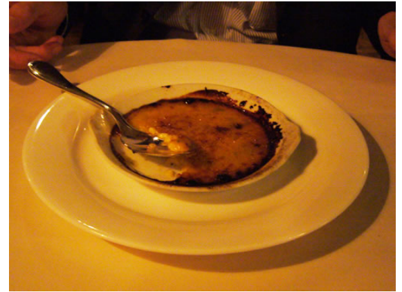
Menu of a French restaurant.