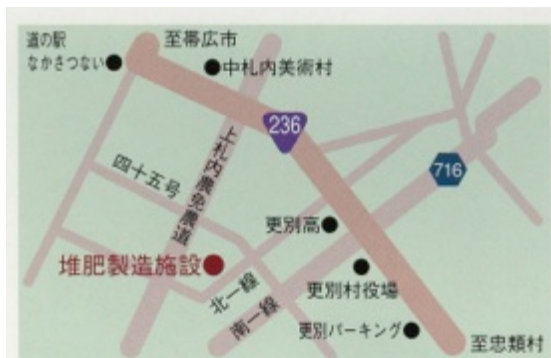
Figure 2. Location of compost facility