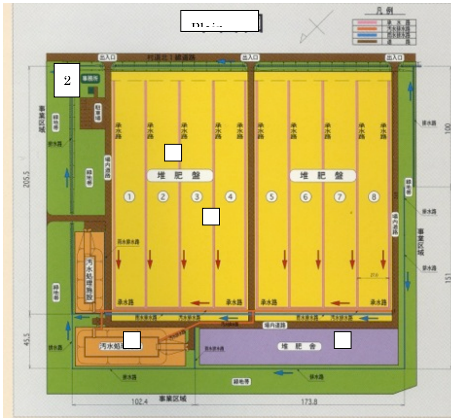
Figure 1. Plain view of the composting yard. (Numbers in the figure shows each facility given in Table 2. )