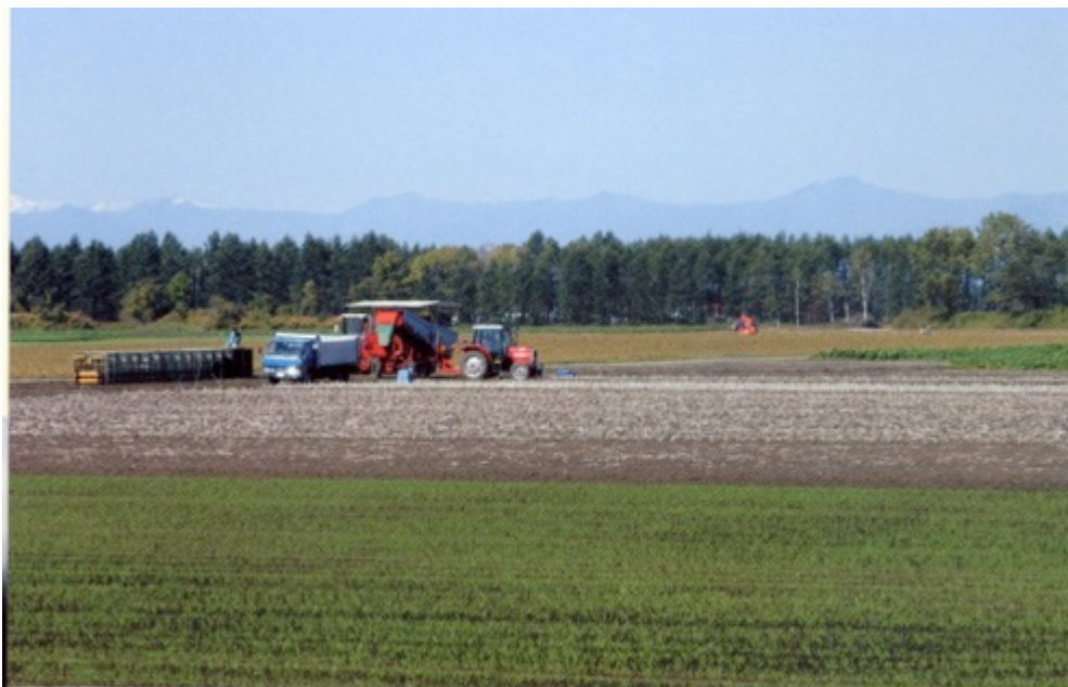
Photo 1. Farmers field in Sarabetsu village